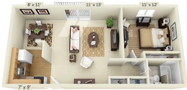
1 Bedroom, 1 Bath • 600 sq ft