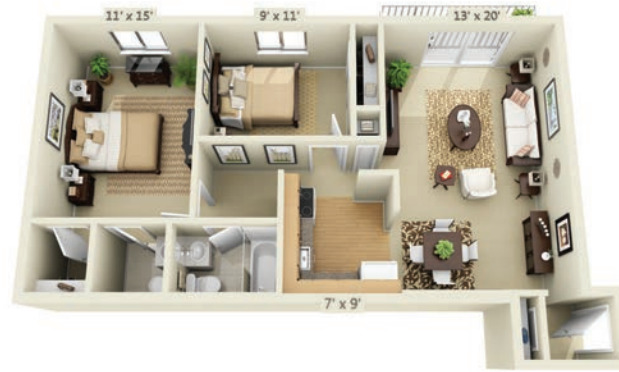
2 Bedroom, 1.5 Bath • 841 sq ft