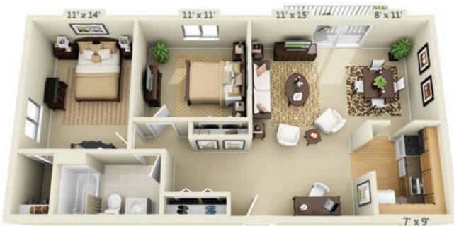
2 Bedroom, 1 Bath • 830 sq ft