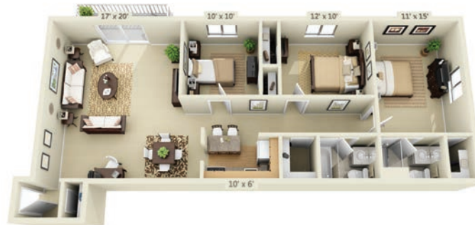
3 Bedroom, 2 Bath • 1242 sq ft